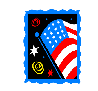
The children are our future.

Divide the class into four political parties, with each party choosing its own name and mascot. Each party holds a "primary" to elect a candi-