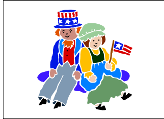
Students prepare for the upcoming election.

As you prepare your students to see Kids For President , begin by using the description on the previous page to tell the children about the show and the company. Then discuss with them what kind of topics they think will be presented in the performance.